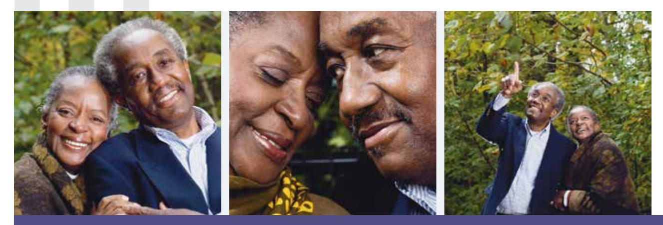
IVOLTEE PARA ESPAÑOL! | FALL 2015